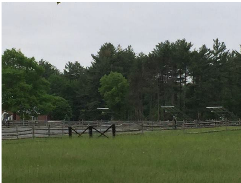
Pole mounted system – agricultural site.