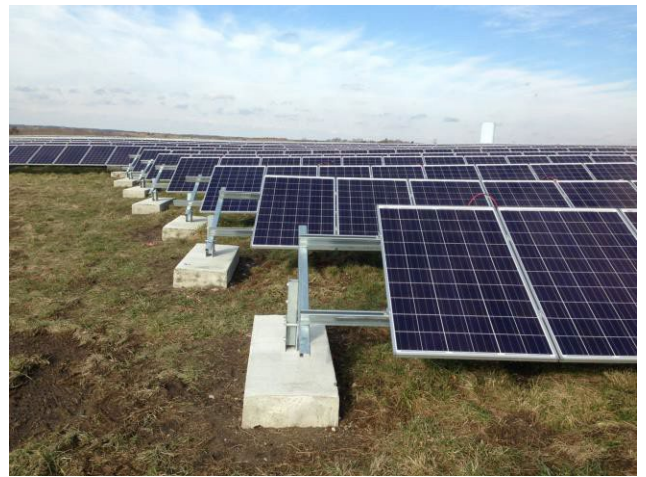
Ballasted system, showing distance between rows and the ballast blocks.