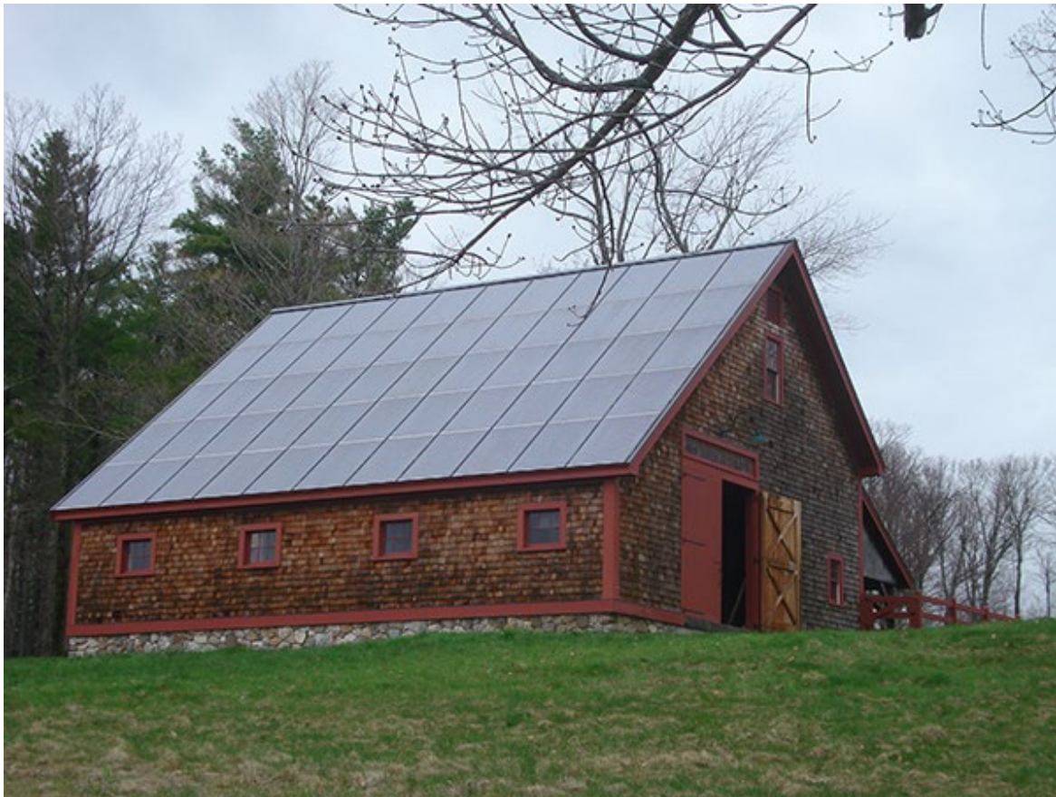
Great Hill Farm barn in Tamworth