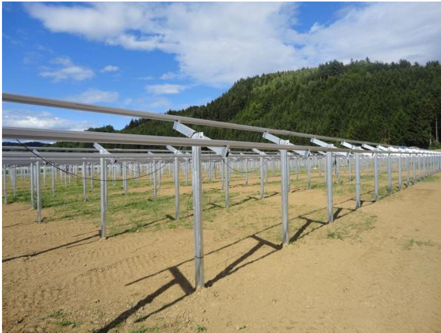
Racking equipment – prior to panel installation.