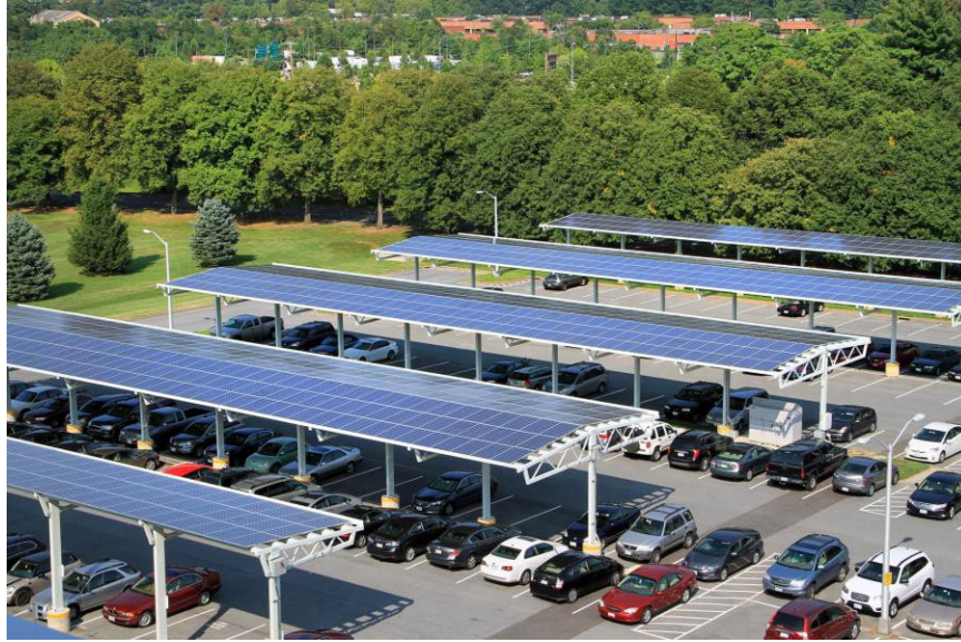
Commercial Carport Mounting