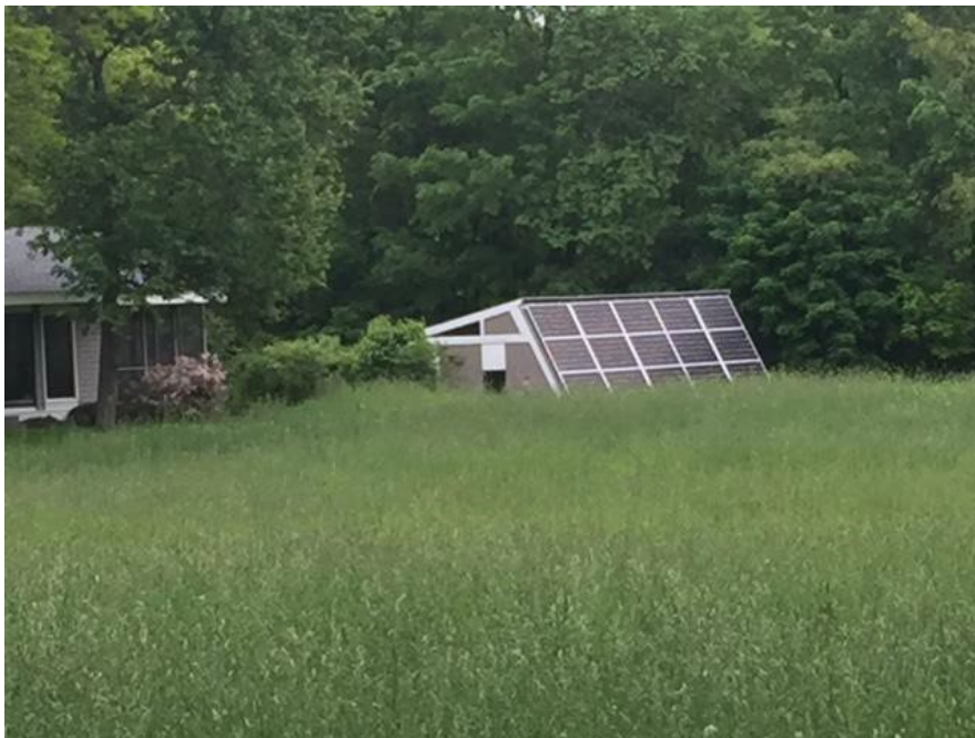
Residential Ground mounted system.