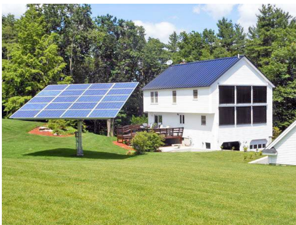
Tracker Mounted Residential System