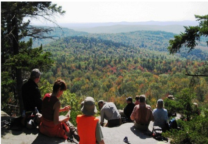
The stunning view that participants were able to take in at last year's Copple Crown Hike!