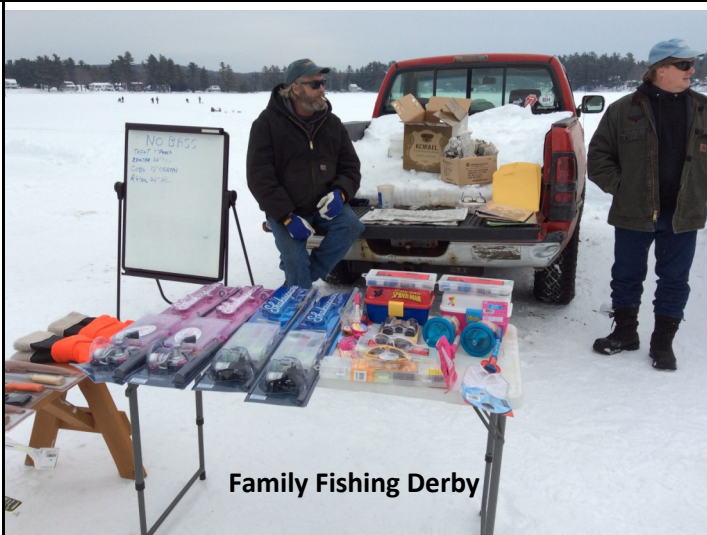
Family Fishing Derby