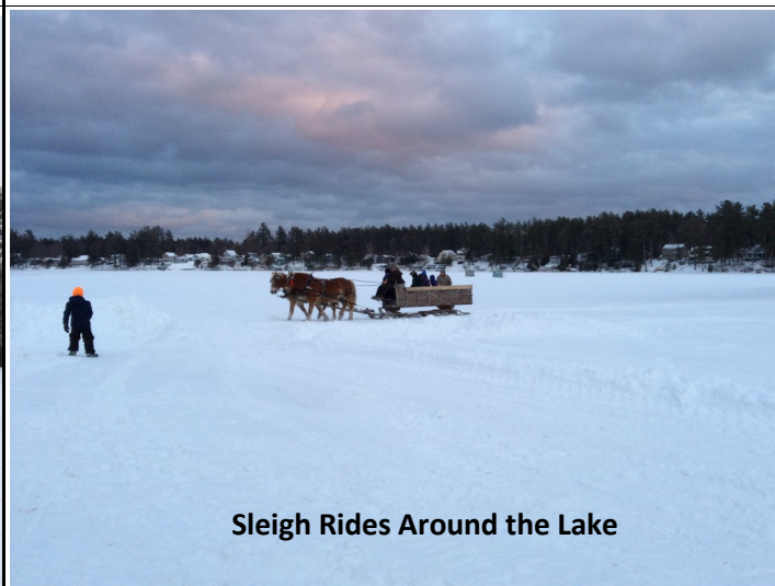
Sleigh Rides Around the Lake