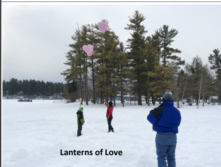
Lanterns of Love