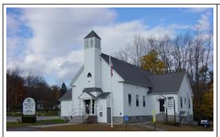
News from Milton Town Hall