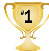
1st Place Truck Eastern Boats!

2020 Milton Spooktacular was a wonderful night with lots of great costumes and trunks!