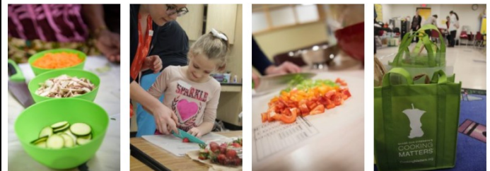
NEW Virtual Courses!

Learn to find whole grains, buy fruits and vegetables on a budget, compare unit prices, and read food labels in order to buy ingredients for balanced family meals. Wednesday, April 21st 5:00 – 6:00pm.