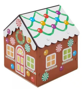
Gingerbread House - December 2, 2023

Join us the first Saturday of each month between 9 am – 12 pm for free in-person Kids Workshops. While supplies last.